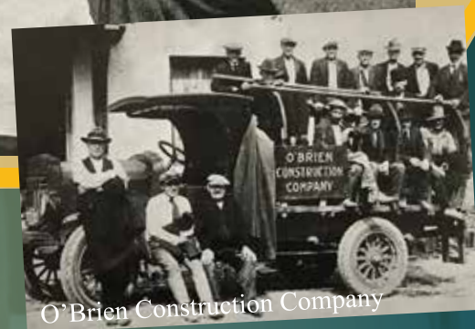
O'Brien Construction Company