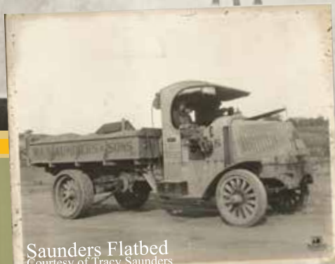
Saunders Flatbed