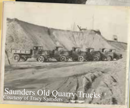
Saunders Old Quarry Trucks