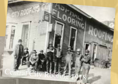
Central City Roofing 1918