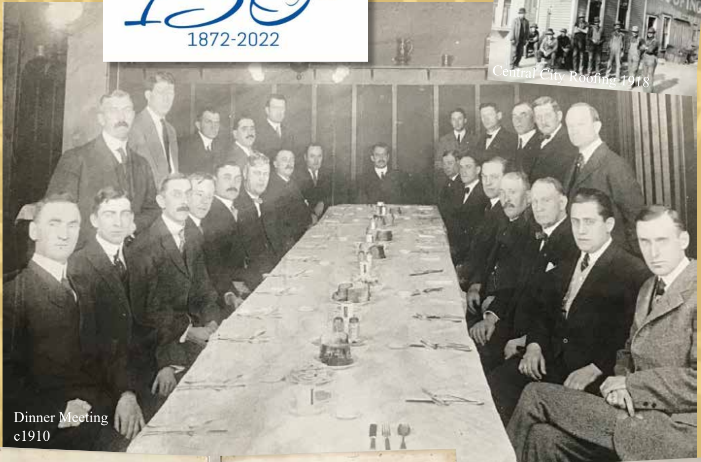
Dinner Meeting c1910